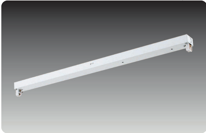
Light Distribution: Indirect-00%. Direct-100%