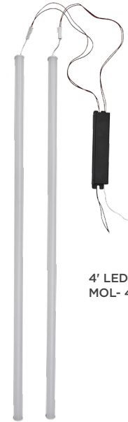
4' LED Lightbar MOL- 44 inches