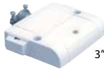
3" w x 3½" L x ¾" H

controls multiple units from one switch, when installed at beginning of run