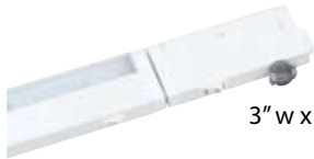
3" w x 6" L x ¾" H