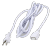
Portable 8' Cord Plug, Back or White