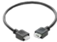
SpeedLink Interlink Cables Available in 10" and 18" lengths, Black or White