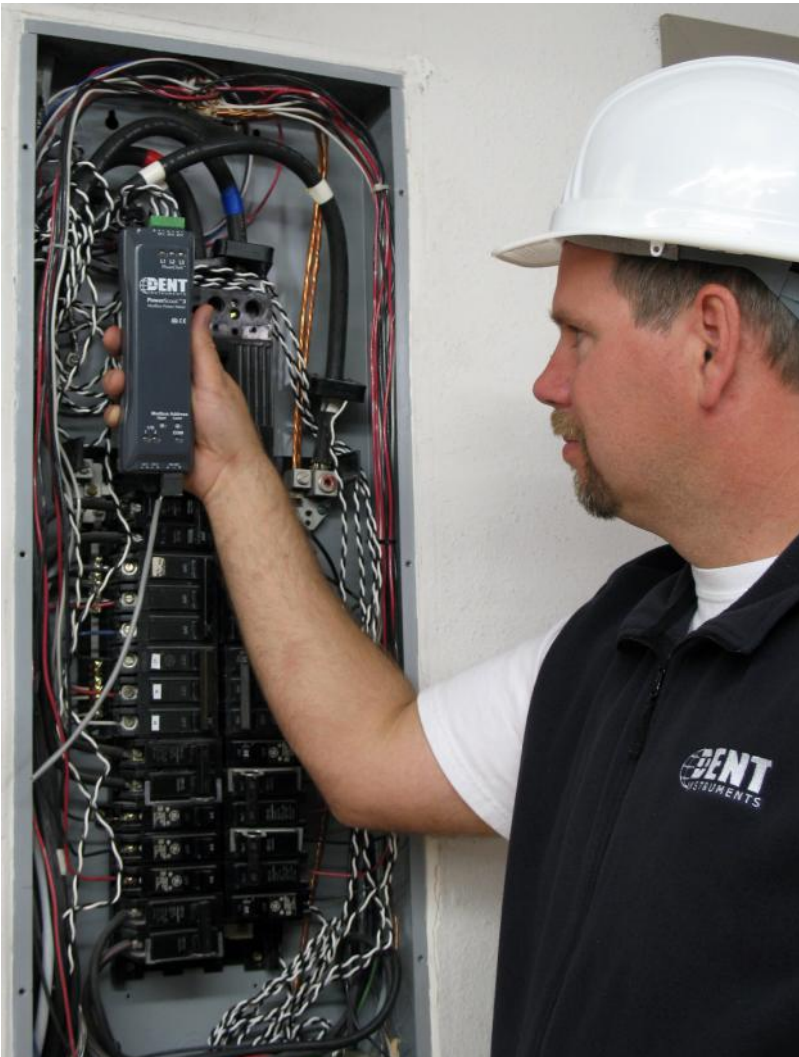
The Next Generation PowerScout™ 3 with Full Utility Metering™.