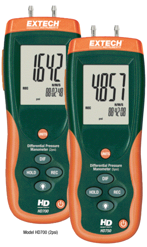
Model HD750 (5psi)