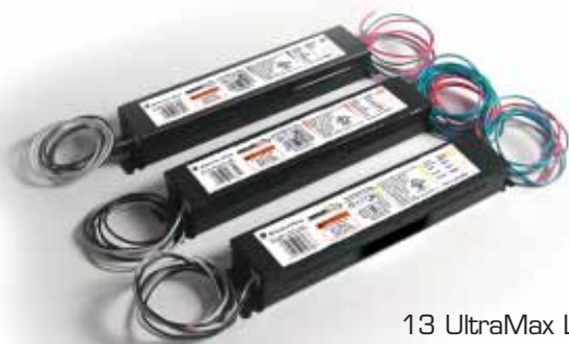
13 UltraMax L, N and H models can replace more than 40 conventional electronic ballasts.

The choice for High light output. With a ballast factor of 1.15, UltraMax™ H delivers the most lumens for maximum light or when you want more savings using fewer lamps. This is the first high-efficiency high-light output line for 2, 3 and 4 T8 lamps.