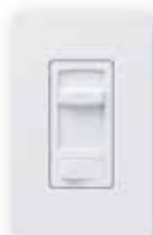
Skylark Contour™ C•L™ Gloss colors