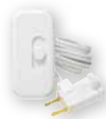
Credenza® C•L™ Black (BL), White (WH), and Brown (BR)