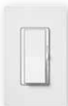
Diva® C•L™ Gloss and Satin Colors®