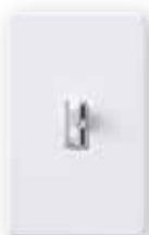
Ariadni® C•L™ Gloss colors (excluding gray)