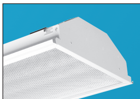
Optional Door Frame Assembly (See HB80/FR Series)