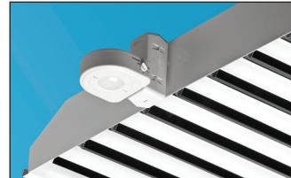
OS Sensor Detail