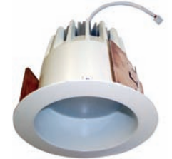
WW White Reflector White Flange