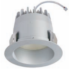
PP Platinum Diffused Reflector Platinium Diffused Flange