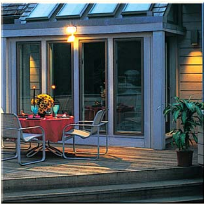
Add reliable security to decks and yards.