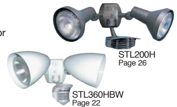
STL200H Page 26