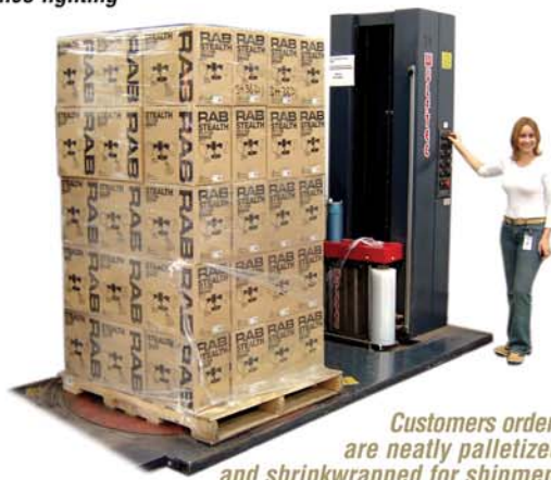
Customers orders are neatly palletized and shrinkwrapped for shipment

Mount over the header of walk-in, swing or sliding door closets for instant convenience lighting