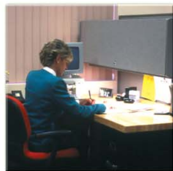
Control desk lights, radios and computer monitors in addition to undercabinet task lights.

Mount over the header of walk-in, swing or sliding door closets for instant convenience lighting