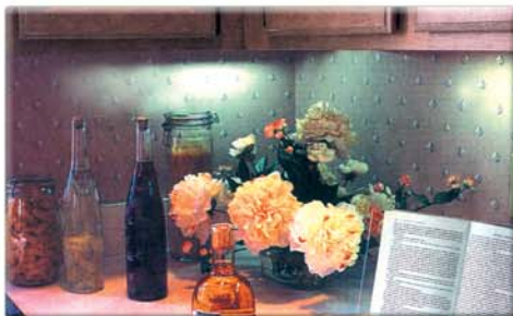
Undercabinet lighting sets the mood and lights the way for an anytime snack.