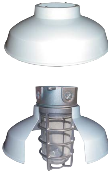
Cutaway illustration of the VX200DG with a Dome Reflector.