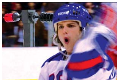
Score! for the U.S. Hockey Team in the movie "Miracle".