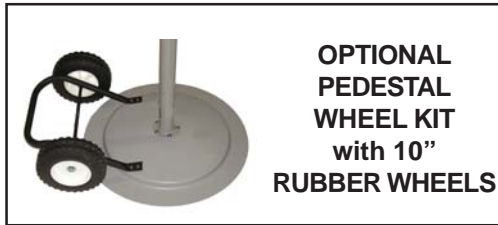
OPTIONAL PEDESTAL WHEEL KIT with 10" RUBBER WHEELS